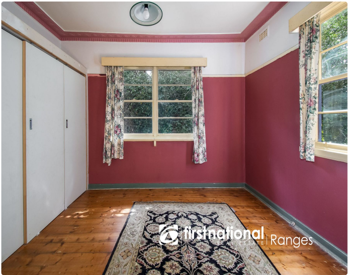
9 Georges Road THE PATCH